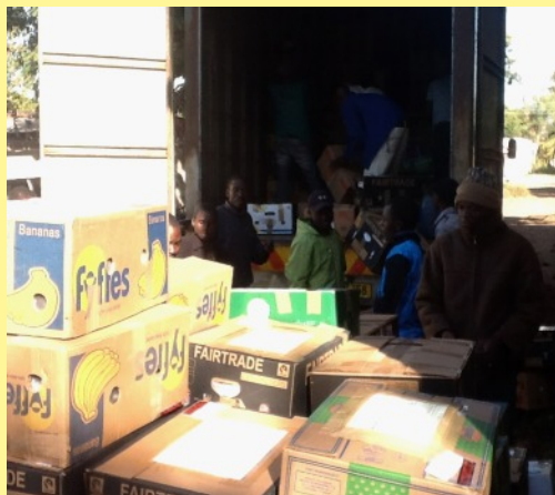
Malawi packs arriving in Malawi